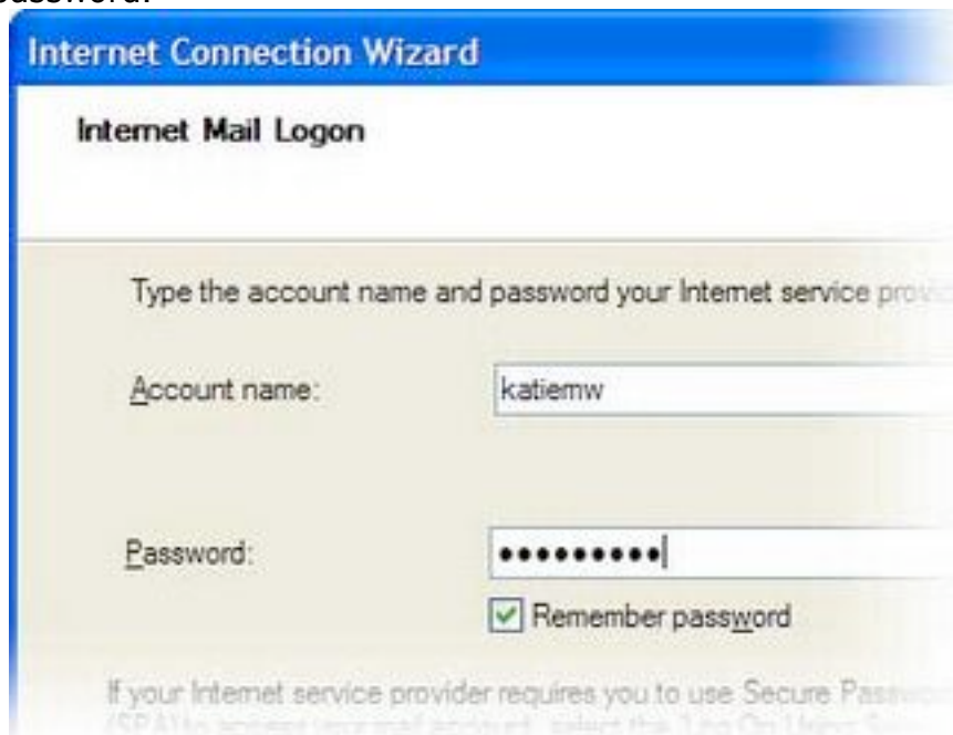
Internet Connection Wizard's Internet Mail Logon

Note: If you're concerned about break-ins to your e-mail, click to clear the check in the Remember Password box. You'll then be prompted for the password each time you send or retrieve mail.