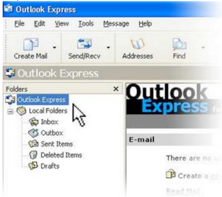
Outlook Express list of folders

If you don't see the list of folders and contacts on the left, click Layout on the View menu. Click Contacts and Folder List to check them, and then click OK .